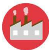
Industry Type (SIC/NAICS)