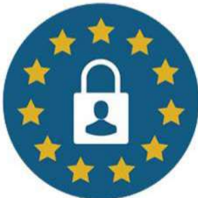
General Data Protection Regulation (GDPR)

As your trusted marketing solution partner, we carry out a fair and transparent data collection and usage process. We have invested in our robust security team to meet the commands of the General Data Protection Regulation (GDPR), California Consumer Privacy Act (CCPA), Anti-Spam, and Can-Spam Act.