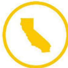
California Consumer Privacy Act (CCPA)